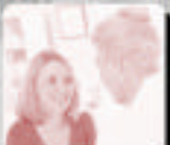
Meningitis on Campus